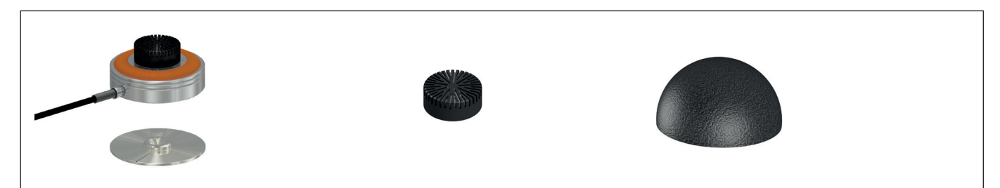
Fig. 1. 147AX with mounting disc, protection grid and windscreen.

The 147AX is a microphone set which is resistant to shock, high temperatures and moisture. It has an integrated, strain-relieved cable, also resistant to high temperatures and moisture. The protection grid has a built-in filter that protects the diaphragm against dirt, dust and moisture.