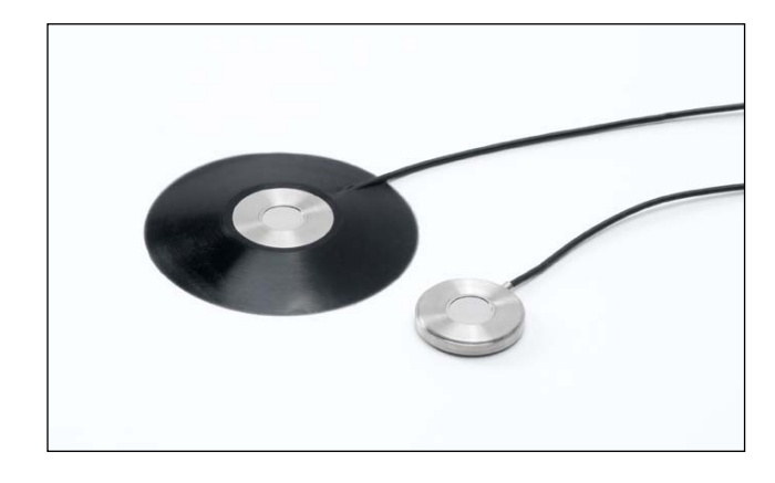
Fig. 1 40LS High-Precision Surface Microphone with and without fairing